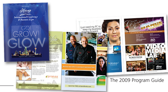
The 2009 Program Guide

Please carefully read the ad specifications on page 2 to ensure that we are able to reproduce your ad in the 2010 Program Guide.