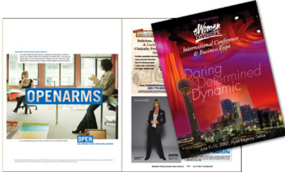
The 2007 Program Guide

Ad Space Reservation Deadline: June 6, 2008