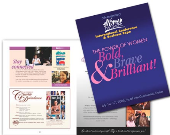
The 2005 Program Guide

Ad Space Reservation Deadline: May 31, 2006